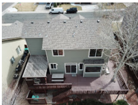
west view - roof slope G is a pergola..jpg